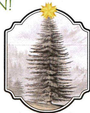
Slocan Spirit of Christmas