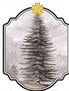
Slocan Spirit of Christmas committee

Everyone is welcome to enjoy this time together to bring in the Christmas Holiday. There will be carolling around an open fire and Santa will stop in for a visit!