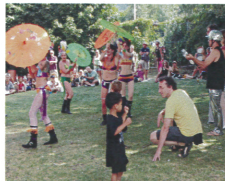
Colour, sound & movement at the 2013 family friendly Unity Festival.