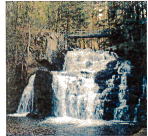
SPRINGER CREEK FALLS