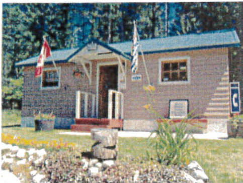
SLOCAN TOURIST/VISITOR INFORMATION BOOTH