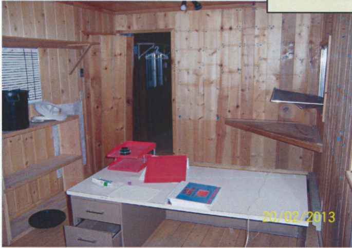
#3 - OFFICE / BUNK TRAILER