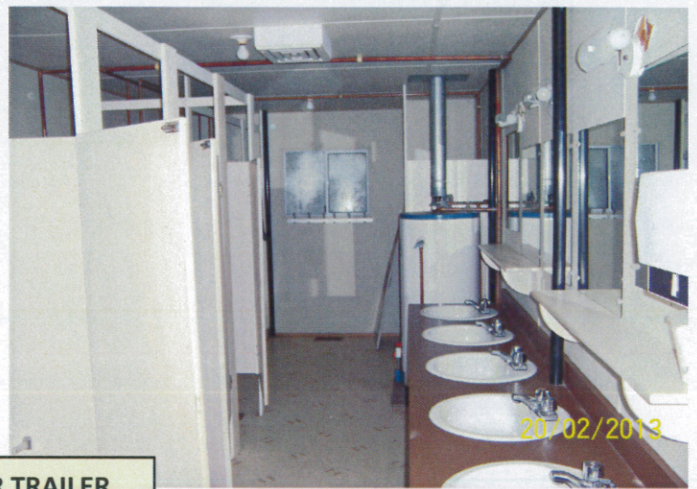
#1 - WASHCAR TRAILER