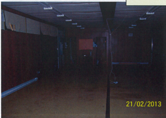
#4 - DOUBLE-WIDE TRAILER