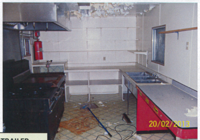
#2 - KITCHEN TRAILER